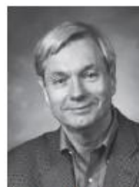
Michael T. Osterholm University of Minnesota, USA